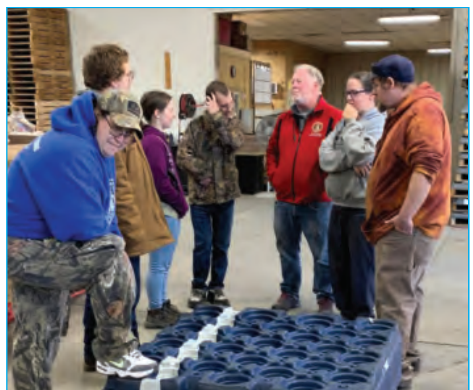
Workshop services include contracts with individual businesses which include everything from small local firms to national corporations.

It's a formula that is a proven winner for Missouri and Missourians.